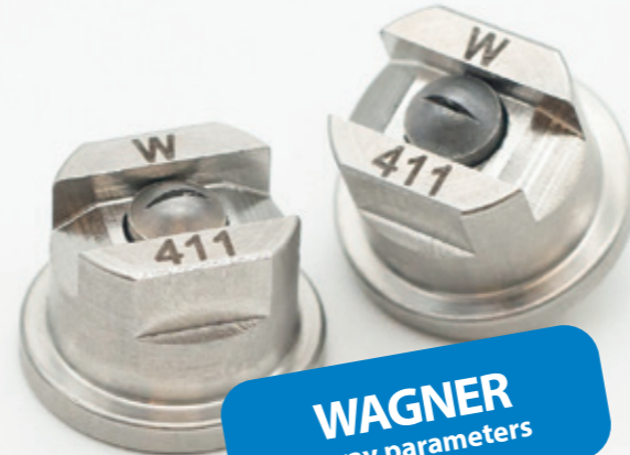
WAGNER spray parameters