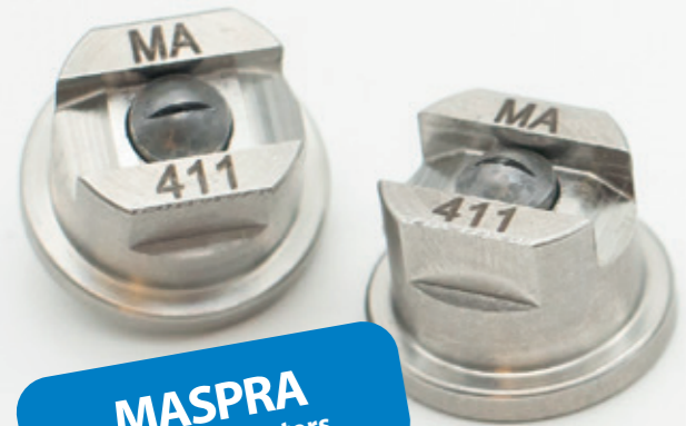
MASPRA spray parameters