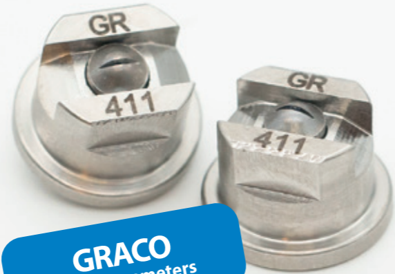
GRACO spray parameters