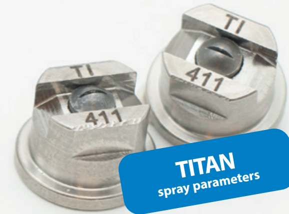
TITAN spray parameters